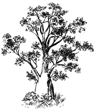
A baobab tree

Many grassland animals are very fast. Owls and many other large birds also live in grasslands. They hunt the many fast rodent animals that scurry around. Many grassland animals also have paws that allow them to dig burrows easily. This is because grasslands don't have many areas for animals to shelter from the weather or to hide from predators. Some animals, such as the prairie dog, dig underground tunnel systems for protection.