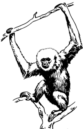
Many species of monkeys live in rainforests

A very large number of plants grow in rainforests because there is so much sunlight and rainfall. Rainforests also provide animals with many places to live.