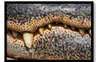
The 'toothy smile' of a crocodile.

Both animals have a mouth full of sharp teeth. Crocodiles have between 60 and 72 teeth in their mouth, whereas alligators have between 74 and 80 teeth. Alligators have an upper jaw which is wider than the lower jaw. In contrast, the upper jaw of a crocodile is approximately the same width as its lower jaw. So, unlike alligators, large teeth on the lower jaw are visible when a crocodile closes its jaws.