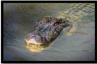
The rounded, U-shaped jaw of an alligator.

People often confuse alligators and crocodiles. They are both large, fierce-looking reptiles. They share similar scaly skin and are both cold-blooded. Both species are millions of years old.