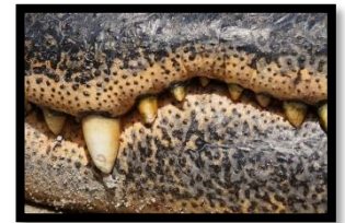
The 'toothy smile' of a crocodile.

Both animals have a mouth full of sharp teeth. Crocodiles have between 60 and 72 teeth in their mouth, whereas alligators have between 74 and 80 teeth. Alligators have an upper jaw which is wider than the lower jaw. In contrast, the upper jaw of a crocodile is approximately the same width as its lower jaw. So, unlike alligators, large teeth on the lower jaw are visible when a crocodile closes its jaws.