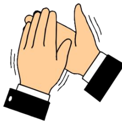
Clap your hands