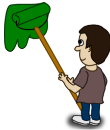
Paint a house