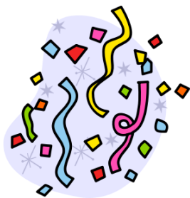
Attend a party