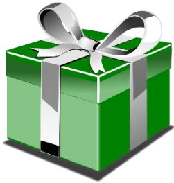
Wrap a present

Estimate and write the duration of each event.