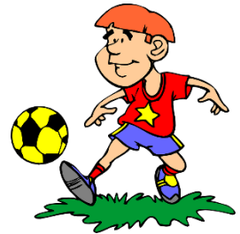
Play a game of soccer