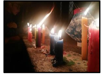
Día de las Velitas

Many people in Colombia begin decorating their houses and streets with candles and other lights in early December. December 7 is called Día de las Velitas (Day of the Little Candles). This is the beginning of Christmas celebrations in Colombia. As well as candles and lights, people in Colombia often decorate their homes with a Christmas tree and a nativity scene. Children write letters to baby Jesus asking for toys. Many Colombians go to 'novenas'. These are events where people come together to pray and sing Christmas songs. Fireworks are a very common part of Christmas celebrations.