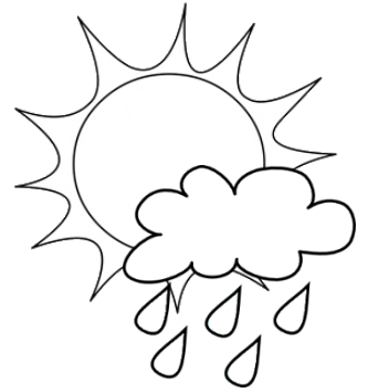
Weather in April