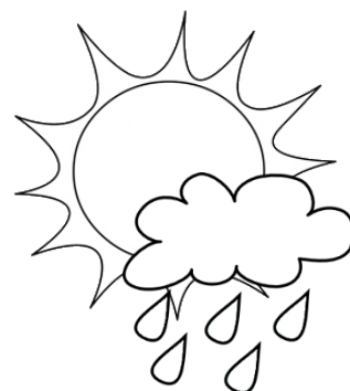
Weather in April